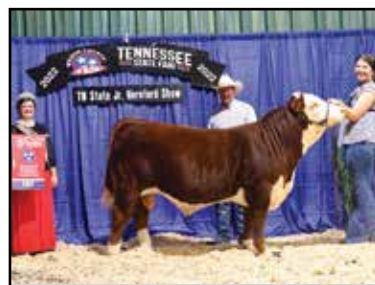
Reserve Champion Bull: HAF 2296 BERETTA J102 (44350527).