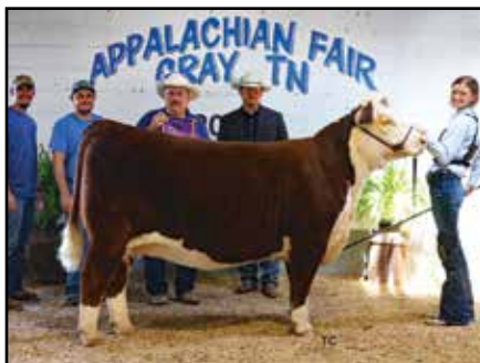
Champion Heifer: LYN FLIP'N' COTTON 3214