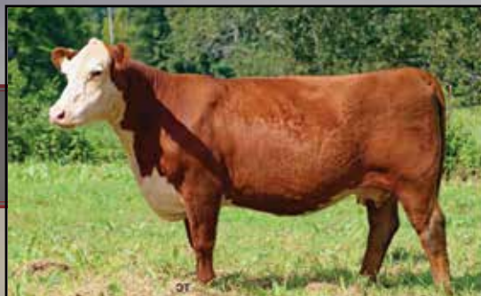
DKM 749 TESSA 86P 976 {DLE,HYE,IEE,MSUDF} (P44039995)