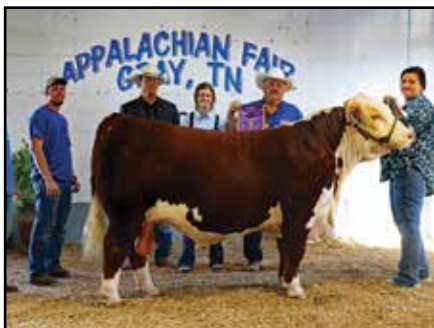
Champion Bull: MTM 2296 714 ARCHIMEDES 123 ET.