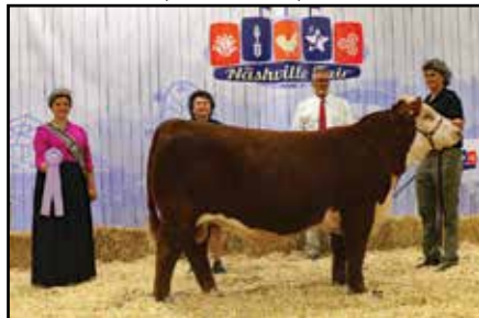
Res. champion bull: RC DEVILLE 4081 170 ET (44334076).