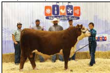
Res. champion bull: CLC 87G MAN POWER 8189 45J (44343049).