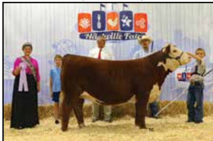
Res. champion heifer: WOMACK SUMMER FASHION 199 (44311484).