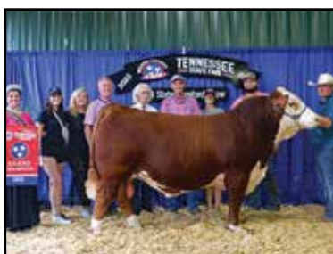
Champion Bull LAND SLINGER 2296 1046 (P44290168).