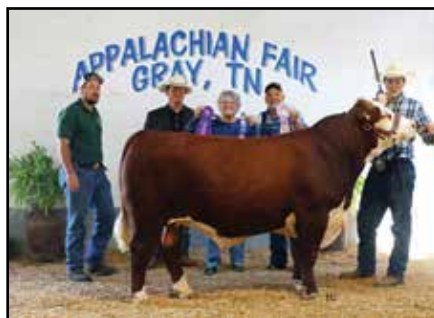
Reserve Champion Bull: ASM 805F STREAM 127J.