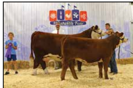
Champion cow-calf pair: WOMACK SENSATIONAL LADY 047 (44181729)