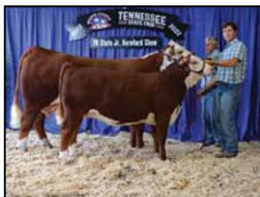
Champion Cow-Calf Pair: WF SWEET SALLY 4050 2080ET (P44007619) and calf, WF 87G MANIFESTO 2080 2436 (P443343064).