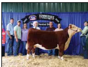
Champion Heifer: LYN FLIP'N' COTTON 3214 (P44283870).