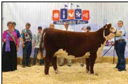
Champion heifer: VSC KYRAS DIAMOND 02E 4J (44257495).