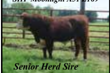
Senior Herd Sire

2022 EPD's BW 4.0 WW 58 YW 95 MM 18 M&G 47 Udder - 1.3 Test - 1.3 REA 0.89 Marb. 0.22 CHB -155