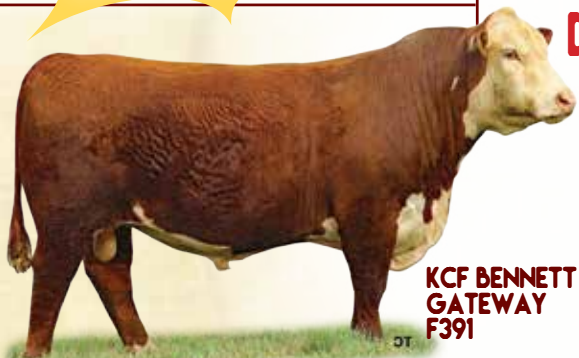
KCF BENNETT GATEWAY F391

ANGUS, HERFORD, GELBVIEH AND BALANCER BULLS