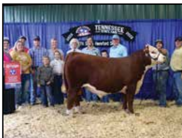
Reserve Champion Bull: GTN WF CLC 87G THE MAN 903 2J (P44338835).