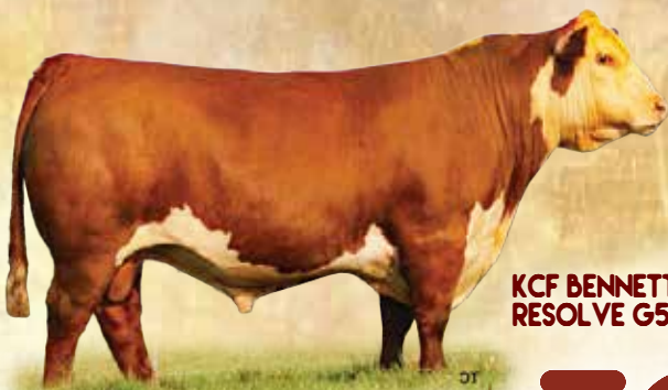
KCF BENNETT RESOLVE G595