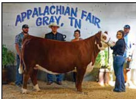
Reserve Champion Heifer: PUGH SHOWTIME DAY NOTICEPJ12ET