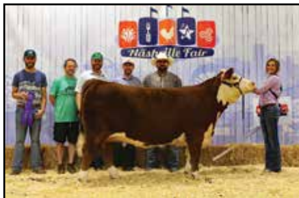
Champion Heifer & B/O: BANNER MPR GUMDROP 2114 (44298307).