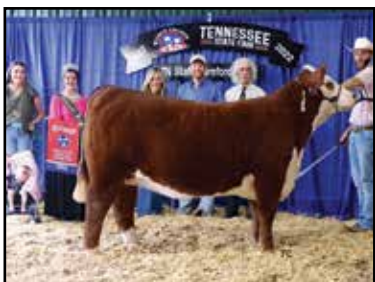
Reserve Champion Heifer HPH 9160 KIM 031I (P44285574).