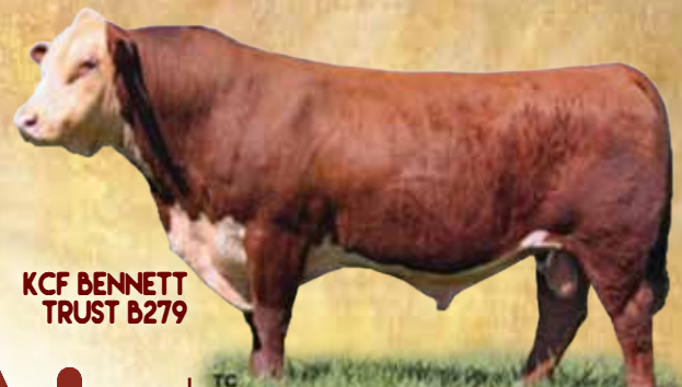
KCF BENNETT TRUST B279