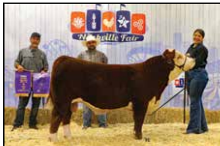
Champion bull: HAF 2296 BERETTA J102 (44350527).