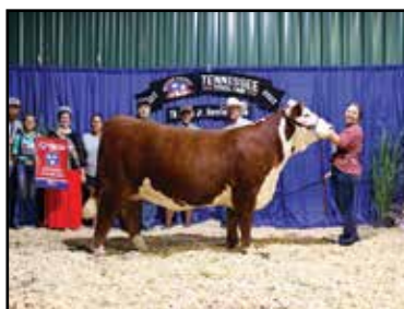
Champion Heifer: KJ BJ 364C SALSA 182H ET (P4422753).