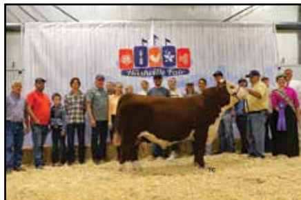
Champion bull: GTN WF CLC 87G THE MAN 903 2J (44338835).