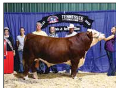
Champion Bull: RBF 2296 Rhett H014 (44240093).