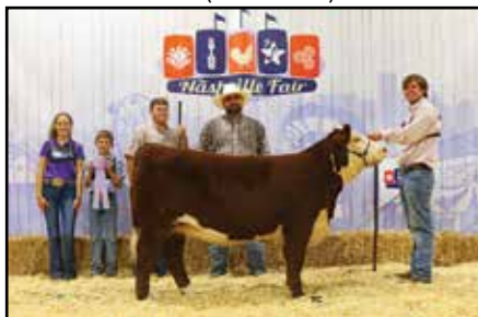
Res. Champion & res. B/O Heifer: CN LADY SUMMITT 1111J (44343496).