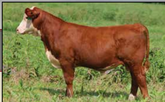
DKM 976 MR CANNON 2014 K50 (P44347042)