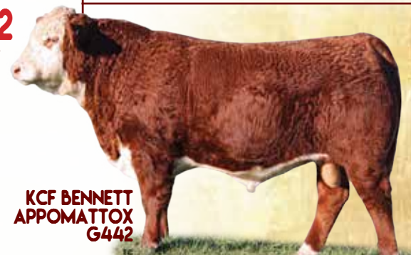
KCF BENNETT APPOMATTOX G442

SELLING SONS OF THESE Sires KCF Bennett Resolve G595 KCF Bennett Appomattox G442 KCF Bennett Trust B279 BEHM 100W Cuda 504C KCF Bennett Acclaim C442 KCF Bennett B716 F597 Innisfail WHR X651/723 4013 KCF Bennett Gateway F391 Loewen Grady B42 G15 KCF Bennett 504C G130