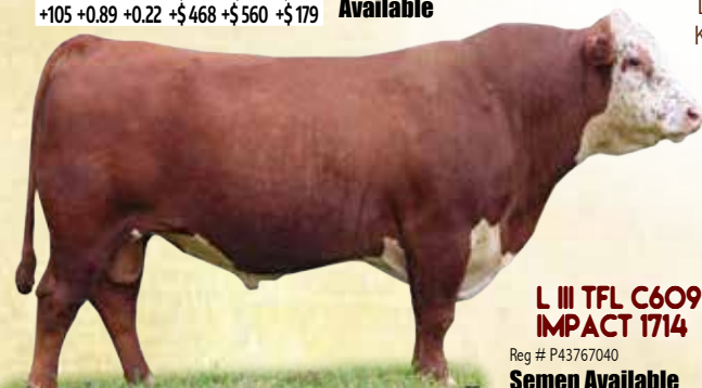
L III TFL C609 IMPACT 1714