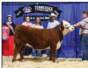
Reserve Champion Heifer: BK JOYFUL GAL 1096J (P44337687).