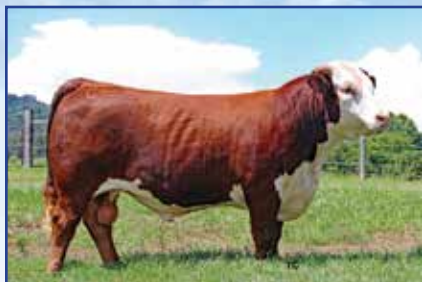
C 4038 BELL AIR 8057 ET