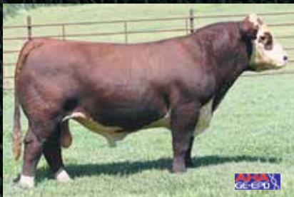
WAGNER DENALI WCC 2107 ET 4/19/21 • AHA P44336808 • Hom. Polled s: Boyd 31Z Blueprint 6153 D: NJW 1A 173D Rita 157F (Endure) CED +13.5, BW +1.2, WW +61, YW +106, MILK +28, REA +.71, MRB +.05, $CHB +138

100 COMMERCIAL FEMALES Fall Pairs & Spring Bred Heifers