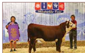
Reserve Senior Bull Calf, River Circle Farm, with RC FAST BALL 793 274 (44436701), calved 44848, sired by BK BH FAST BALL F102 ET