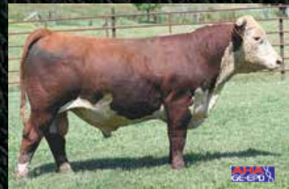
BF 864 POWER SURGE 1165 9/11/21 • AHA 44306863 • Horned s: Boyd Power Surge 9024 D: BF 2094 Eddi Time 4218 (Dimaggio) CED +7.0, BW +2.8, WW +71, YW +106, MILK +34, REA +.62, MRB -.01, $CHB +122

— Request your sale book online at burnsfarms.com , email laytond@yahoo.com , or text 405.464.2455 —