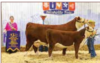
Champion Cow/Calf, Levi Womack, Pembroke, Ky. with WOMACK SENSATIONAL LADY 047 ET (P44181729), calved 3/8/2020, sired by UPS SENSATION 2296 ET.