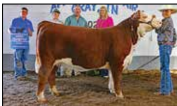
Champion Heifer: DAY JEZEBEL 20F 902 74K.