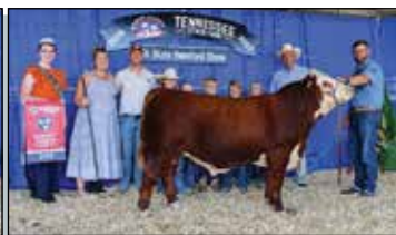
Reserve Champion Bull: CLC 0016 Fine Print 76E 134KET.