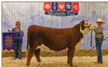
Champion Intermediate Heifer, Rhett Day, Day Ridge Farm, Telford, Tenn. with DAY LADYSPORT MINDY 53D 70K ET (44355785), calved 5/11/2022, sired by NJW 84B 10W JOURNEY 53D.