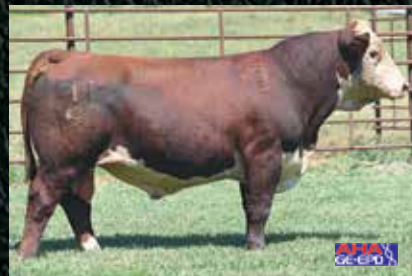
BF 864 ROCKET MAN 1193 10/15/21 • AHA P44306893 • Polled s: BF 1310 Rocket Man 629 D: BF RF Maya 9241R (Mandate) CED +2.4, BW +1.9, WW +67, YW +104, MILK +28, REA +.26, MRB +.18, $CHB +93