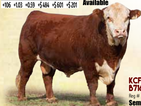
KCF BENNETT B716 F597 Reg # P43983894 Semen Available