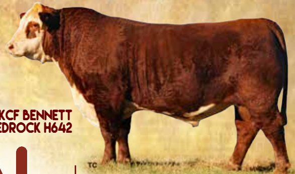
KCF BENNETT BEDROCK H642