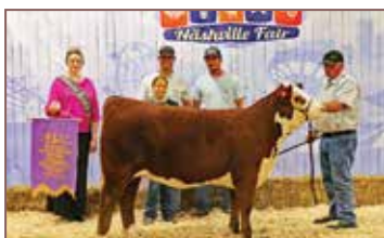
Reserve Junior Heifer Calf, Chapman Land and Cattle, Nunnally, Tenn. with CLC 9365 ENTICE 9090 158K ET (44448432), calved 1/2/2003, sired by UPS ENTICE 9365 ET.