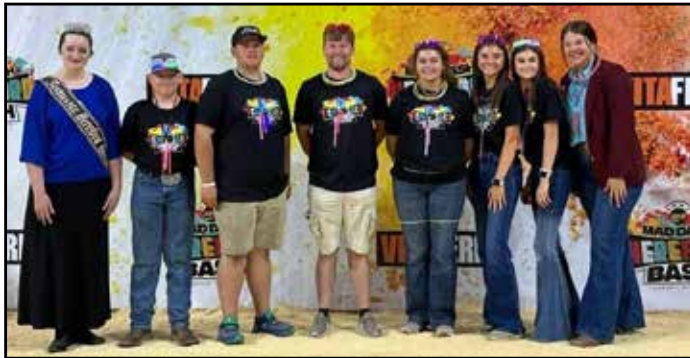
TJHA members at the 2023 Junior National Hereford Exposition.

Hereford cattle from across the United States and Canada made a Mad Dash to The Hereford Bash in Madison, Wisconsin. Tennessee was one of many states represented in Madison, July 7-14, for this year's event. Tennessee was well represented this year with 11 exhibitors and a NJHA Junior Board Member. Tennessee juniors not only exhibited cattle but were involved in many of the social programs and contests that the JNHE offers.