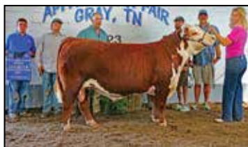
Champion Bull: RPC 8246 007 ROCKY 228.