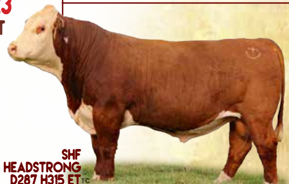
SHF HEADSTRONG D287 H315 ET