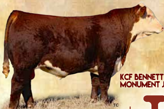
KCF BENNETT MONUMENT J338