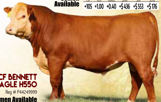
KCF BENNETT EAGLE H550 Reg # P44249999 Semen Available