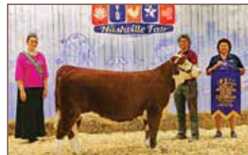
Champion Senior Heifer Calf, River Circle Farm, Hartsville, Tenn., with RC MS FASTBALL 8029 277 (44436702), calved 11/2/2022, sired by BK BH FAST BALL F102 ET.