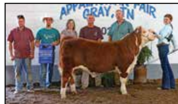
Reserve Champion Bull: LYN FLIP'N RIOT.