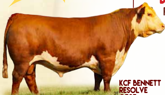
KCF BENNETT RESOLVE G595