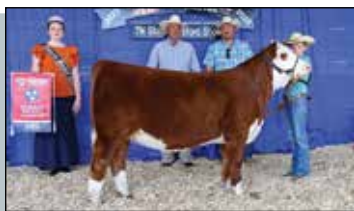
Reserve Champion Heifer Womack Redneck Lady 2307 ET.