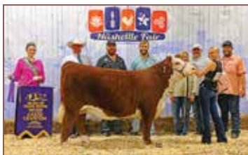
Grand Champion Heifer and Champion Junior Yearling Heifer, Hopkins Ranch, Winchester, Tenn. with H BL HONEY 216ET (44380970), calved 2/11/2022, sired by SR DOMINATE 308F ET.