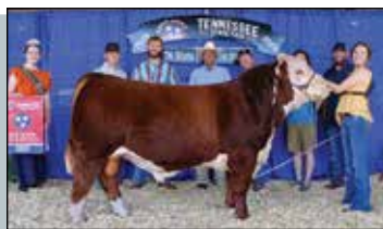
Champion Bull: Banner MPR HPH Yellabush 2260.