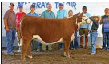
Reserve Champion Heifer: MTM FRC S7 NAOMI 231 ET.