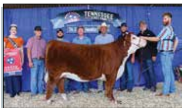
Champion heifer: H BL Honey 216 ET.