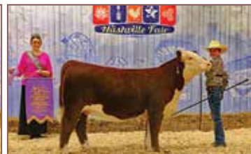
Reserve Senior Heifer Calf, Rhett Day, Day Ridge Farms, Telford, Tenn. with DAY JEZEBEL 20F 902 74K ET (44401844), calve, 9/6/2022, sired by H SWANSON 902 ET